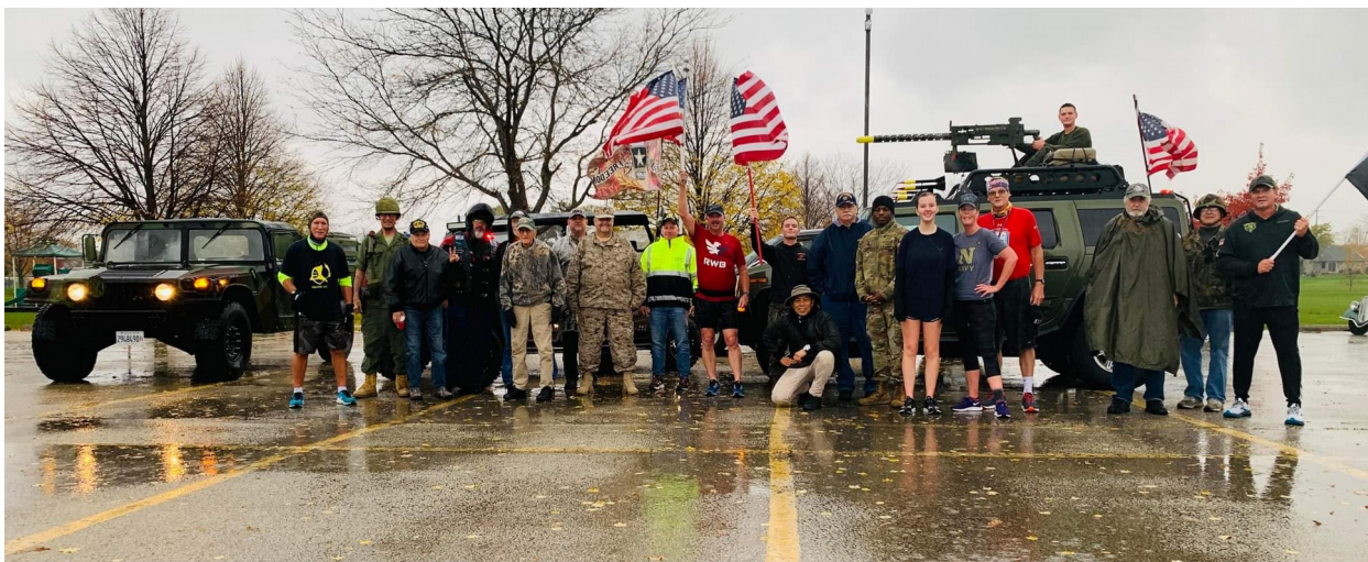
The Veterans Day Military Warriors Run to School team