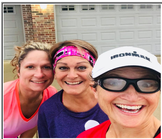
Some miles for the girls for the challenge: