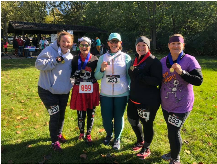
The Great Pumpkin Race at the State Park. Showing off some medals: